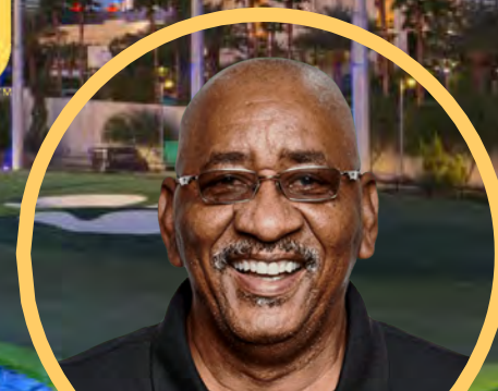
George "Iceman" Gervin